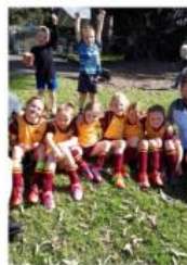
FAMILY FOCUSED CLUB

more information WWW.KINCUMBERROOSFC.COM.AU or email secretary@kincumberroosfc.com.au